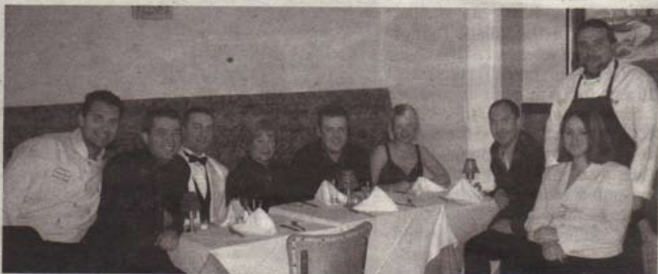
The cast of "Broadway A La Carte" is seen here with the Soldano family.

Following a salad course, visitors chose chicken sorrentino, veal or eggplant for dinner. The evening finished with "New York, New York" and tiramisu.